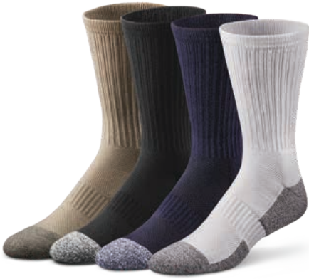
A | Crew Length