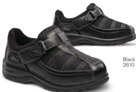
Black DD 2610