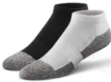
C | No Show