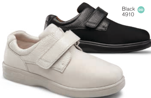
Black DD 4910