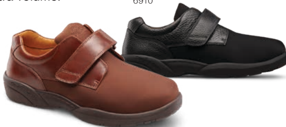
Acorn DD 6920