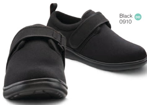
Black DD 0910